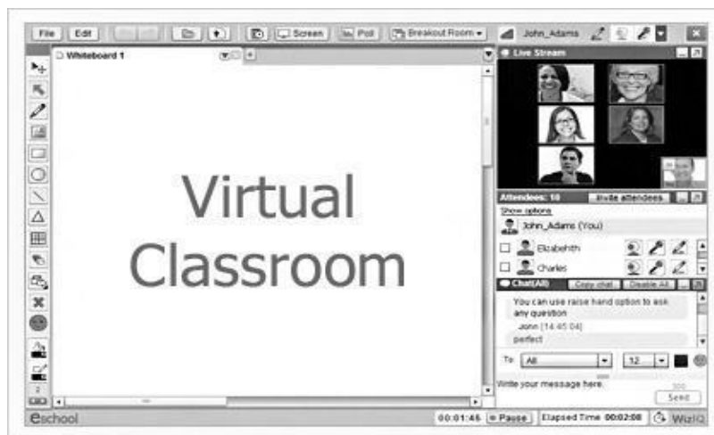
Figure 1. Virtual Classroom

For this type of web learning , providers usually provide courses free of charge and everyone can attend this course without the fear of having to pay . Value obtained from commercial advertising or other content providers who are interested in filling the web. Free course typically take the commercial value of the advertisers and the content providers . Of course here the content providers have to carry the mission of " education " . Such models generally use the media text , images , interactive quizzes , chat , and even free e - mail address. Interaction between teachers and learners , learners and other learners performed through mailling list , e - mail or text chat .