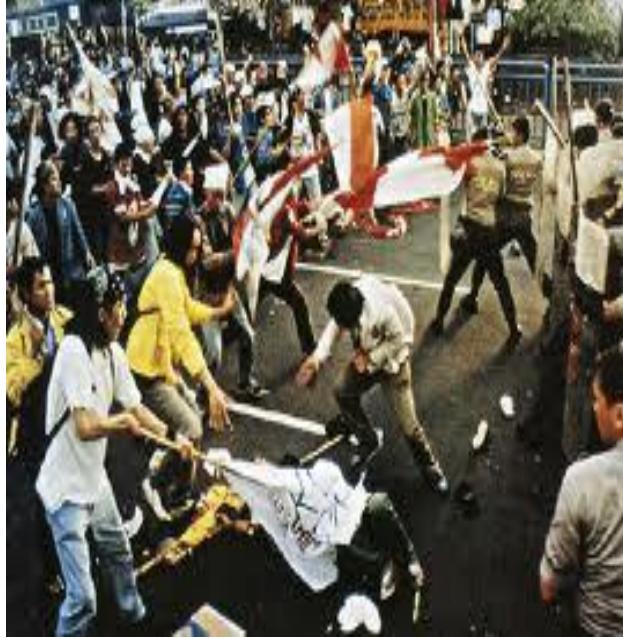
Image 2: "Wave of student protests,"

In 1978, there was a great movement that is rooted of students at various universities in Indonesia. They demanded "clean government." The word "clean government" refers to a serious problem with dirty government policy. Students, as a moral movement, reminded the leaders that run in clean government, honest and dignified. At that time, the term Collusion, Corruption and Nepotism (KKN) does not exist. Students continue to strive forward to achieve good governance but stopped by the military. Campus castrated by the government policy of NKK and BKK. Campus silenced immediately and freeze old student organization, to form a new organization under the authority of the campus bureaucracy.