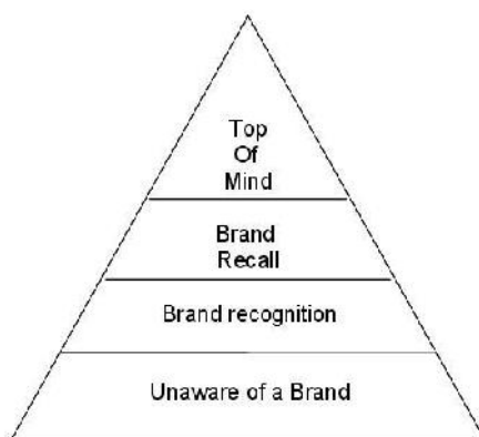
Figure 1. The Awareness Pyramid

The Aaker's opinion (1991) as can be seen in Figure 1