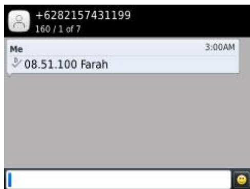
Gambar 7. Desain Interface SMS Gateway Registrasi

The time of registration, the same as the web-based registration, alumni and password required to enter its NIM to do filling in Tracer Study. With this condition can prevent others to enter into the system by claiming to be authorized alumni., But if the alumni will forget a password ever made, may submit an SMS back to the system for its memberitahukan password. Password will be sent to the phone number corresponding to the time of registration alumni beginning to collect data about themselves on the alumni form, while the graduation.