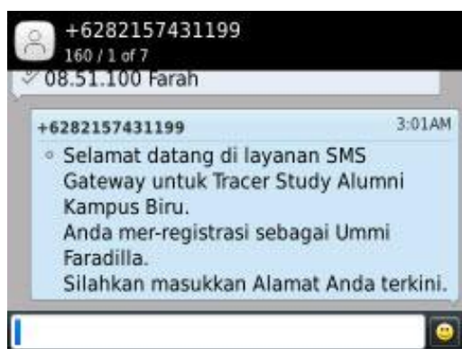
Figure 8. Interactive System on SMS Gateway Tracer Study

Alumni do not need to enter specific parameters to answer questions from the interactive processes that occur. alumni include only the answers of the questions. This condition is made to simplify the existing process and does not highlight the complexity of the system are made, but the convenience and ease of access, because the important information of alumni of the campus is very much needed for future developments.