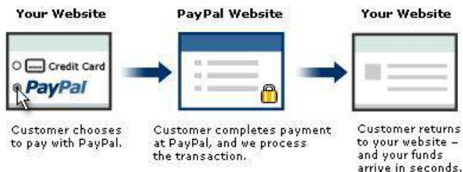
Figure 3.2. check out process using paypal

Increase sales with efficient checkout process that is added on site as shown in Figure 3.2.