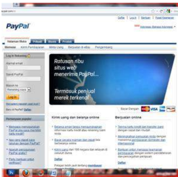
Figure 2.1. Display the home page of Paypal

Paypal was founded in 1998 in San Jose, California and acquired by eBay in 2002. Paypal more credible because of security against unauthorized payments sent from account 100% protected. Figure 2.1 shows the appearance of the home page of Paypal.