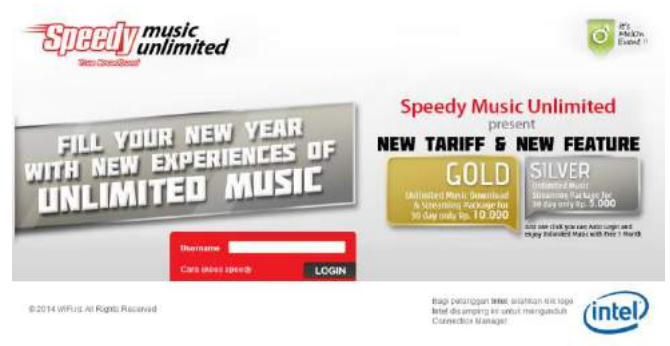
Figure 4: Speedy login page Screenshot