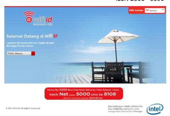
Figure 2: Portal Website Main Page Screenshot

If the home page displayed it is mean that the user have been connect to the internet. Home page included by articles and log out feature if user want to disconnect with the internet. The following screenshots of Indonesia Wi-Fi portal website: