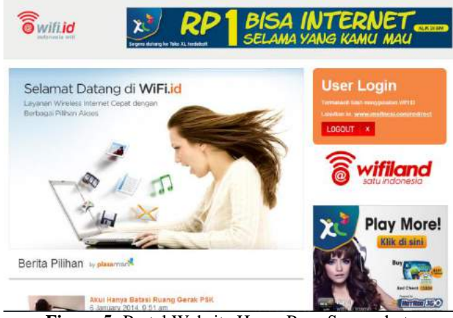
Figure 5: Portal Website Home Page Screenshot