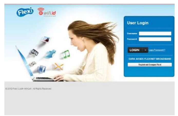
Figure 3: Flexy login page Screenshot