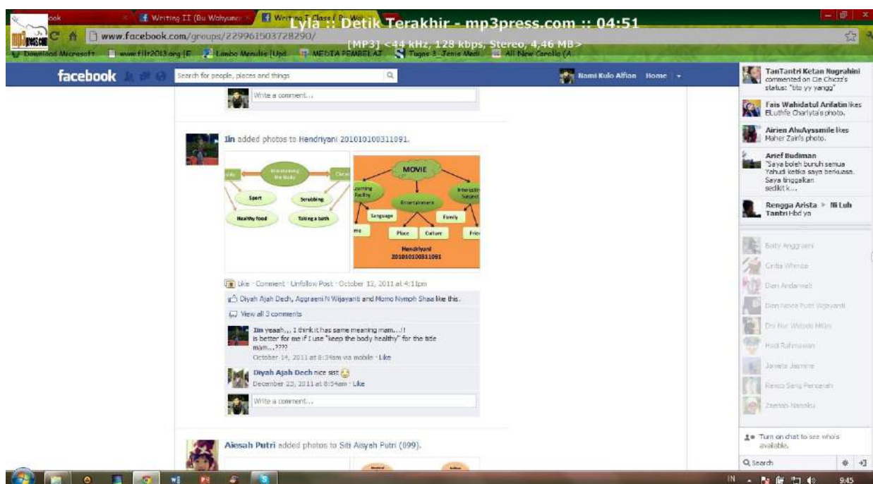
Fig. 2 The sample of student's work in making mind mapping.

In starting the teaching process, teacher may give some materials in the classroom as brainstorming to the students. It can be the way of organizing idea in a paragraph or even an essay and also the rules in academic or scientific writing. Next, by those materials, the teacher stimulates them to develop and enrich their knowledge about it and give them an assignment as reinforcement for students. In classroom activities, teacher may guide the students' study process and create student centered approach. They should stimulate students to have independent learning and being active during the learning activities in the classroom. Teacher has an important role in this approach to direct and guide the students to avoid unexpected thing.