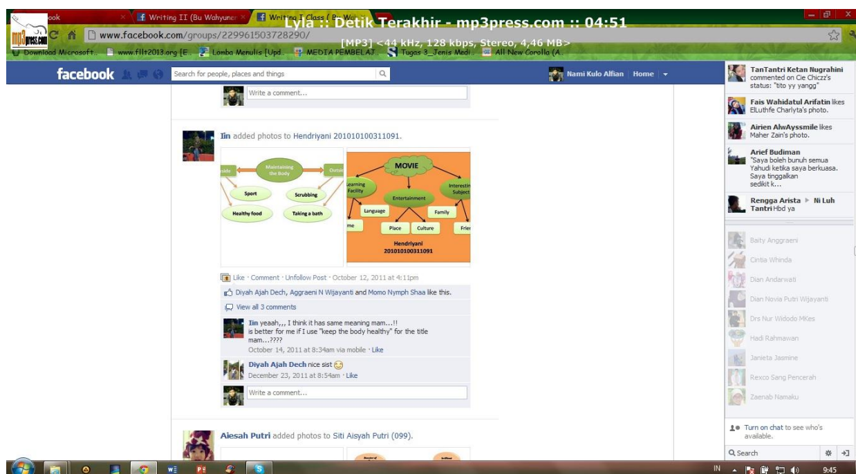
Fig. 2 The sample of student's work in making mind mapping.

In starting the teaching process, teacher may give some materials in the classroom as brainstorming to the students. It can be the way of organizing idea in a paragraph or even an essay and also the rules in academic or scientific writing. Next, by those materials, the teacher stimulates them to develop and enrich their knowledge about it and give them an assignment as reinforcement for students. In classroom activities, teacher may guide the students' study process and create student centered approach. They should stimulate students to have independent learning and being active during the learning activities in the classroom. Teacher has an important role in this approach to direct and guide the students to avoid unexpected thing.